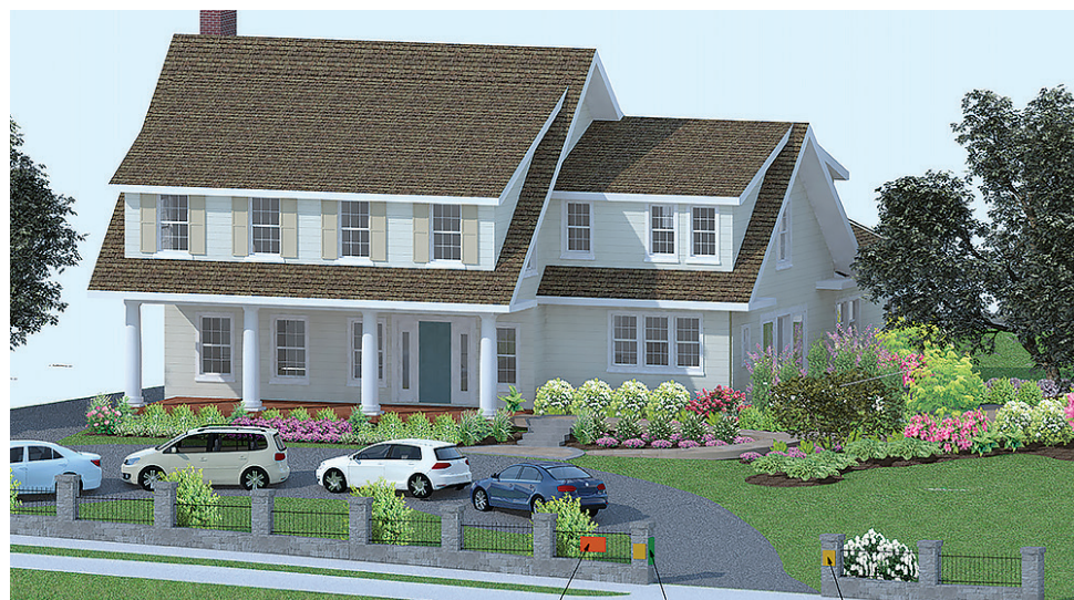
Scheduled to open in 2020, the house to be constructed at 418 Capital Avenue in Frankfort would serve as a branded location for 1NKY's state-level legislative activities.

Start your journey to a better life today. gateway.kctcs.edu/better-life