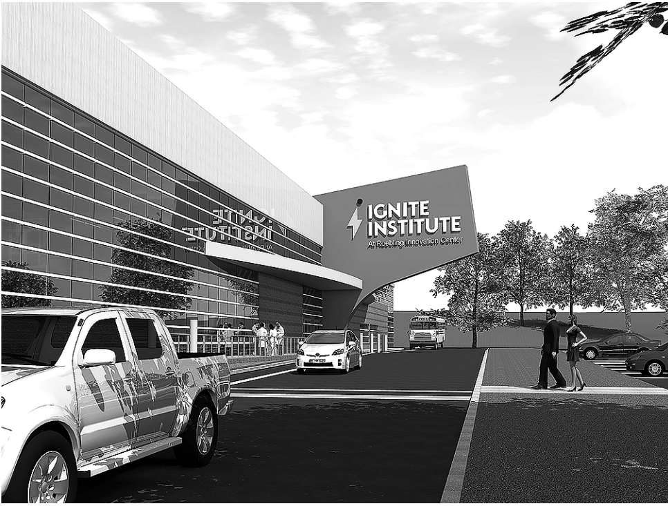
Northern Kentucky's STEAM-based IGNITE Institute opened its doors to students for the 2019-2010 school year in August.

cessation programs are targeted to Covington and Gallatin County.